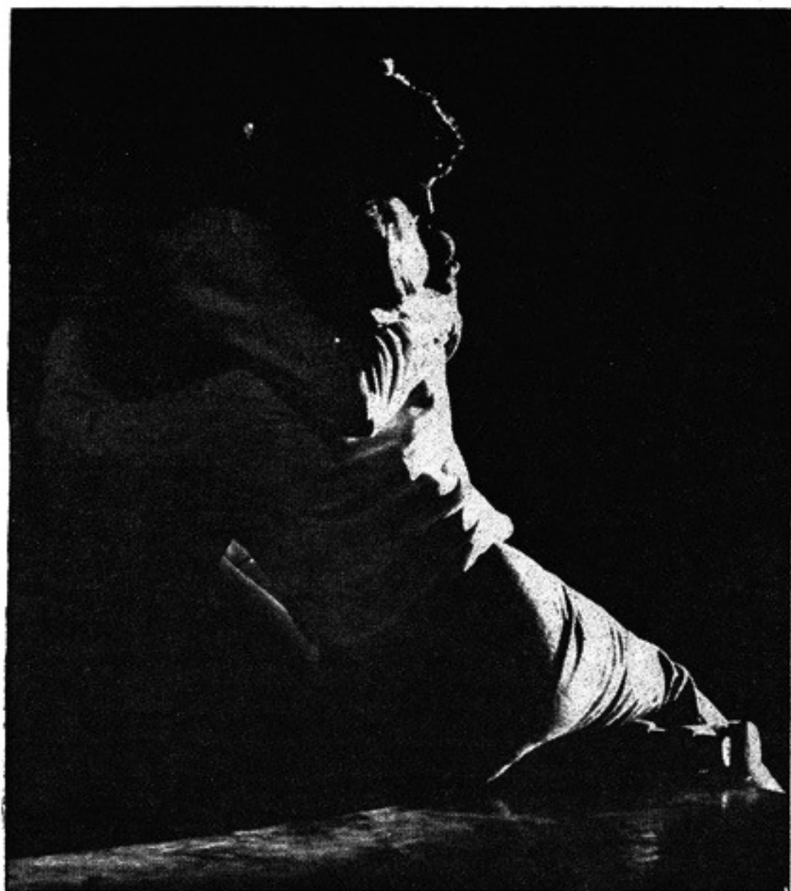
It's almost black magic, the way Engelbert Humperdinck mesmerizes femme audiences nowadays—as demonstrated when one lucky fan gets the full treatment (including that never-to-be-forgotten kiss) during a recent song-performance in New York.