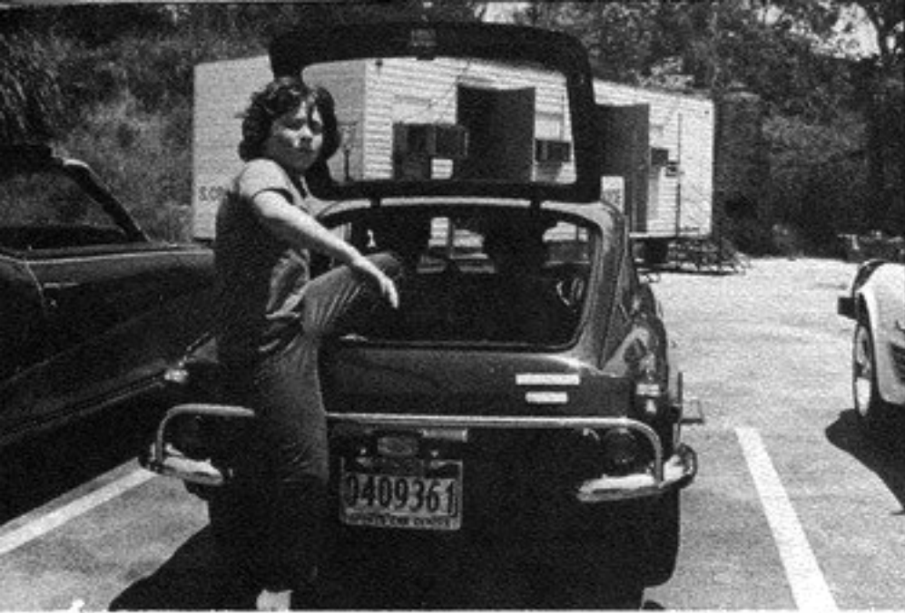
Red-haired and freckled Danny Bonaduce looks like he's all set to go. The big question is where?