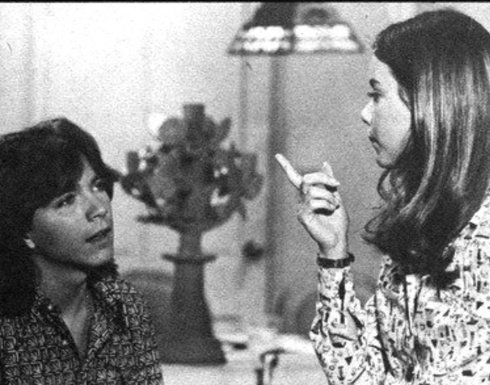
David Cassidy and Susan Dey talk over a scene the two of them are about to do. They sure look busy.