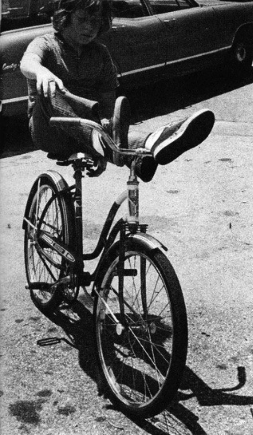
Dare-devil Danny Bonaduce is the most difficult of all The Partridges to keep track of. It's hard to tell just what his next move is going to be. Here, he's spending some of his off-camera time doing tricks on his bike. He may say "Look, Ma, no hands!" but Mrs. B. is probably not smiling.

Suzanne Crough sure looks as though she's ready for a touch of mischief. Now that her acting chores for the day are over, she's all set to head for home and get in some play time before bed. Suzanne, a sports-lover, may just be planning to challenge her brothers to a hot 'n heavy football game.