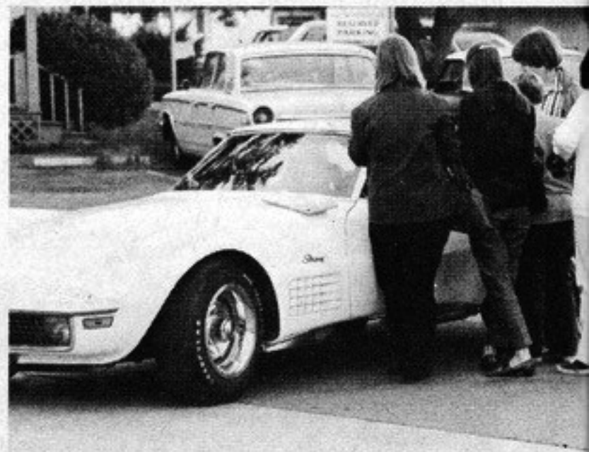
DAVID CASSIDY stops daily to sign autographs for fans outside the gates of Columbia Ranch. David says he's begun to wear disguises so he can attend pro basketball games!

Actors signed by one of the biggest agencies reported that earnings of $35 million for performing in movies and TV shows—and $65 million for doing TV commercials.