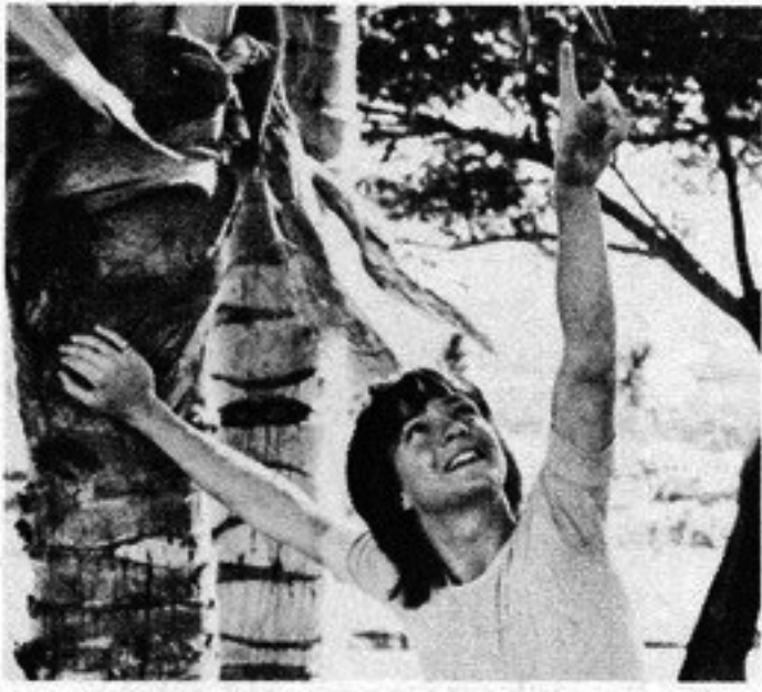
David's 2nd Hawaiian trip was super!

Two Superstars visited the Hawaiian Islands this month—BOBBY SHERMAN and DAVID CASSIDY. After spending a peaceful week at Big Sur along the Northern California coast, DAVID took off for a week in Hawaii as you can read about on page 3 in DAVID'S own words. The week DAVID returned, BOBBY finished filming the first 13 segments of his show and then took off for a well-deserved vacation. Instead of staying on the big island of Oahu, BOBBY saw all the is-