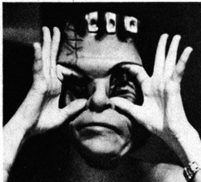
Would you believe Donny Osmond?

They close off the room so it's really dark, then hang pillows and such from the ceiling that can be dropped on people's heads and little scary tricks like that to make you leave the room screaming! I only got to hear about it, though, 'cause no one is allowed to go through it until Halloween night! As I was about to leave, DONNY was trying to get ALAN to drive to the store for more freak masks!