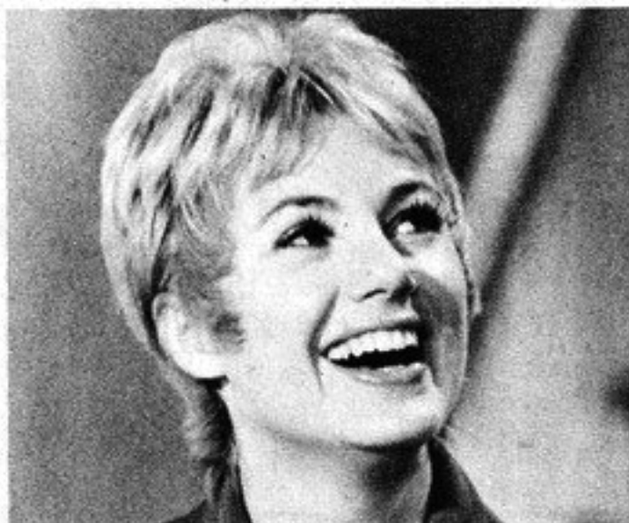
74 Shirley—a super dresser!

Out on the "Partridge Family" set the other day, I was waiting to talk to DAVID , who was busy filming a scene when SHIRLEY JONES arrived for work. I noticed her right away because of her stunning outfit—navy blue suede knee-high boots and a matching navy blue suede coat with top stitching, and a matching blue hat. But then, she took off the coat and the men on the set really flipped! She was wearing a hot pink hot pants outfit and did she look great! It's hard to believe sometimes that she's the mother of three growing boys and plays a mother of two teenagers on TV.