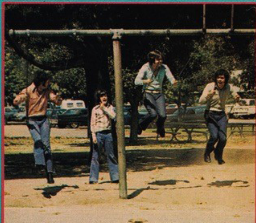
A SWINGIN' FAMILY—That's the Osmonds! More than anything, the Osmonds enjoy family outings whether it's a picnic in the park or touring a new city they've never seen before!