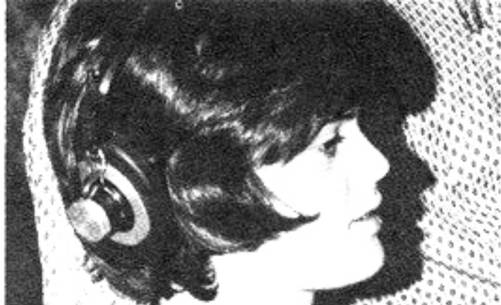
A. That sweet 'n sensitive nose belongs to Donny Osmond .

Didja get all four right? Boy, you really know your noses!!