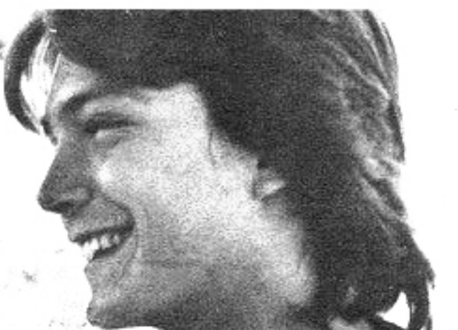
D. And that truly beautiful nose belongs to none other than darlin' David Cassidy .