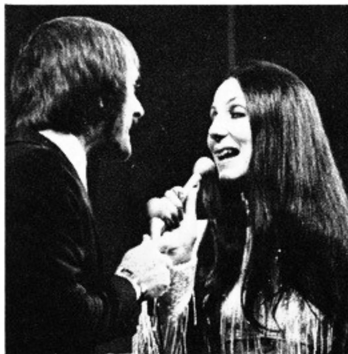
THE SONNY AND CHER comedy hour moves to 8:00 P.M. Fridays so more people can groove with it!