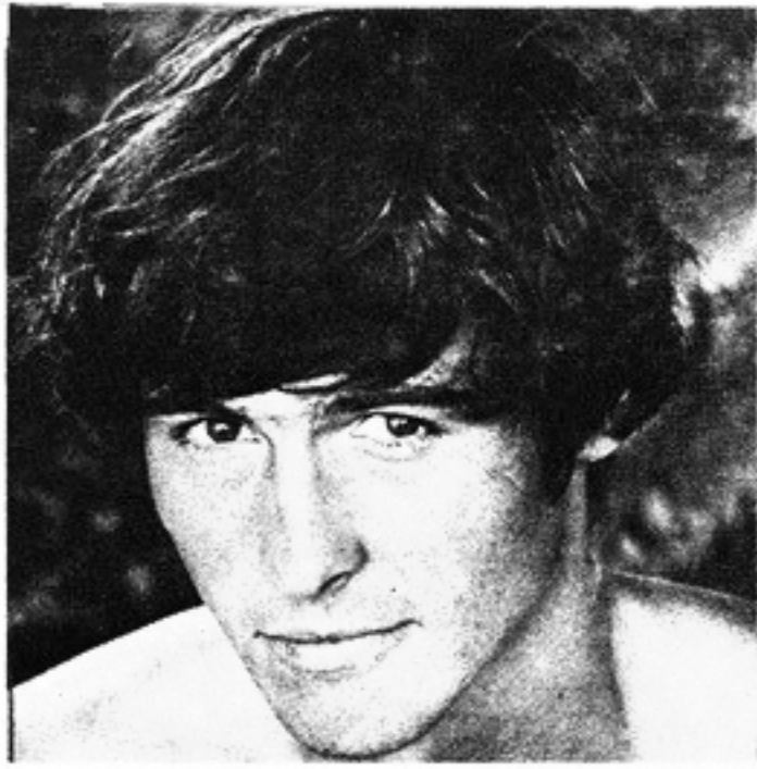
RANDOLF MANTOOTH really loves animals! Especially dogs and cats!