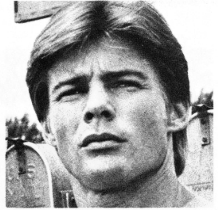
JAN MICHAEL VINCENT stars in Disney's "World's Greatest Athlete."

"We made quite a spectacle driving down the highway. The trip went well until we were just outside Omaha, Nebraska. The car broke down and the four of us were stranded on the highway. So I walked about a half mile to a nearby farmhouse, found no one there, and went back to the highway. Finally we got picked up by a trucker who was on his way to California. So I arrived in Hollywood in the back of a truck surrounded by my dog, cats, and sacks of grain!"... THE OSMONDS or THE JACKSON FIVE , which group is YOUR favorite? Well, no matter which one is your favorite, I know that there's absolutely no jealousy between them! How do I know? Because WAYNE told me "We're a family and they're a family, so people compare us." Actually, the OSMONDS and THE JACKSON FIVE are friends! And if you don't believe me, just listen to what DONNY has to say, "I talked to MICHAEL on the phone yesterday for a couple of hours. He called me up. We're buddies!" So a rotten raspberry to those stupid rumor-mongers who've been saying that there was some jealousy between them! I can tell you THE