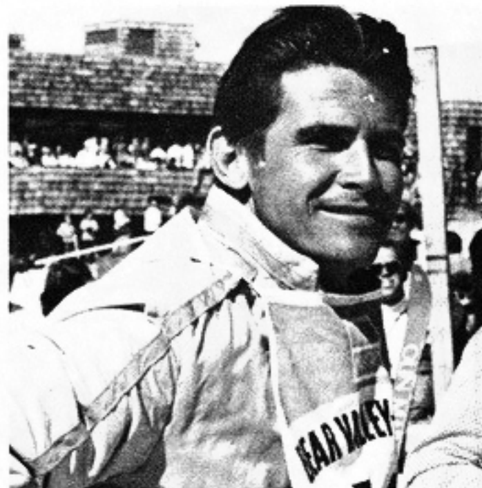
JIM BROLIN took time off from "Marcus Welby" to throw snow at Ben Murphy in beautiful Bear Valley!