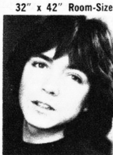
32" x 42" Room-Size IN FULL COLOR

Put Them Together and You Get The LARGEST DAVID CASSIDY POSTER In The World!