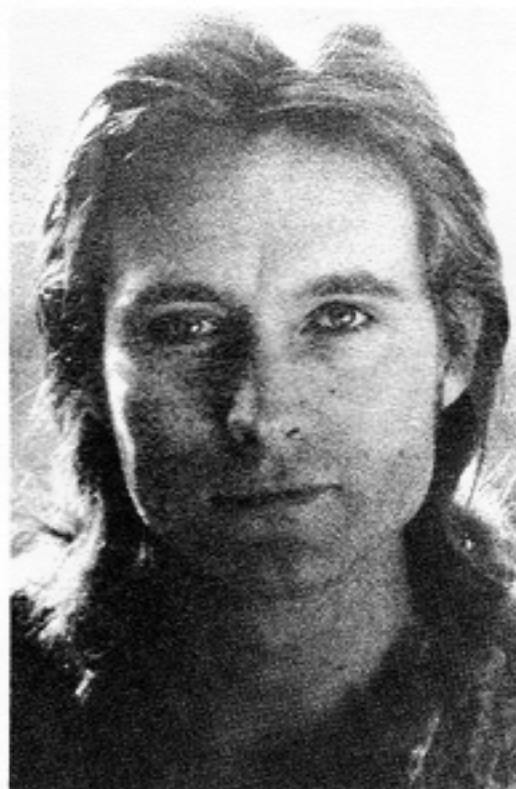
John Phillip Law