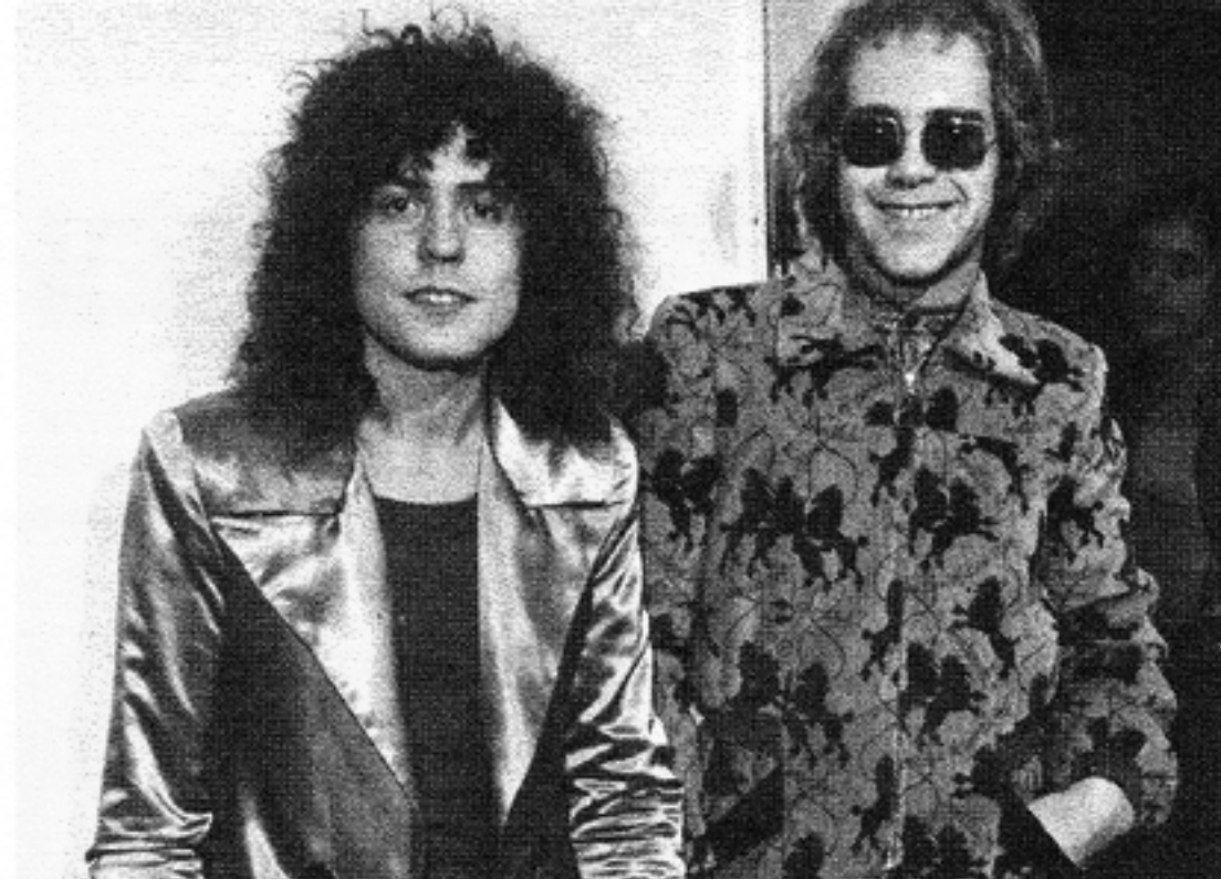
Marc Bolan & Elton John

EDDIE HARDIN and PETER YORK had their musical beginnings as members of the Spencer Davis Group. They've now split to form their own duo called HARDIN & YORK—and their first London LP effort is For The World . It's a wild 'n woolly rocker—grab a copy!... The latest doin's of TOMMY ROE—pop singer extraordinaire—include Beginnings , a super ABC LP stuffed with good-time entertainment. His hit single Stagger Lee can also be heard on this album, so don't miss the fun—catch up with talented Tommy.