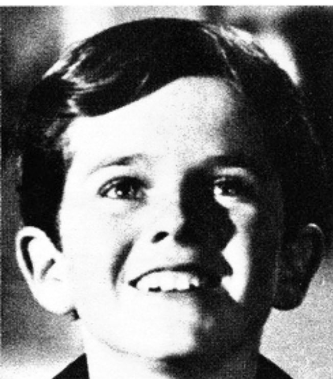
A. Butch Patrick