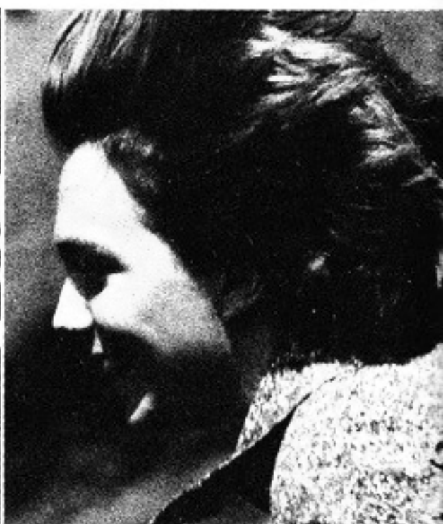
D. David Cassidy

WHEW!! That was really hard, wasn't it? How many didja guess right? All four?! Good for you!!