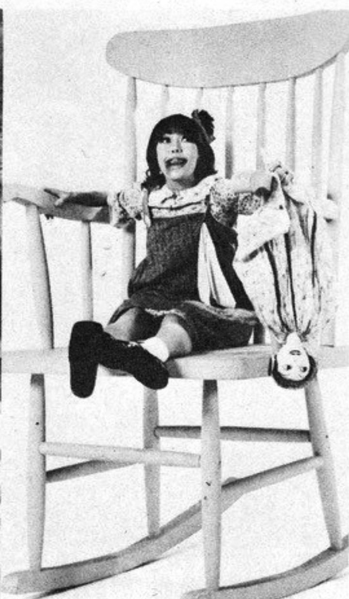
"LAUGH-IN's" Lily Tomlin is a hit with her character 5-year-old Edith Ann.

Center," followed by the Lucy, Moore, Day and Van Dyke things.