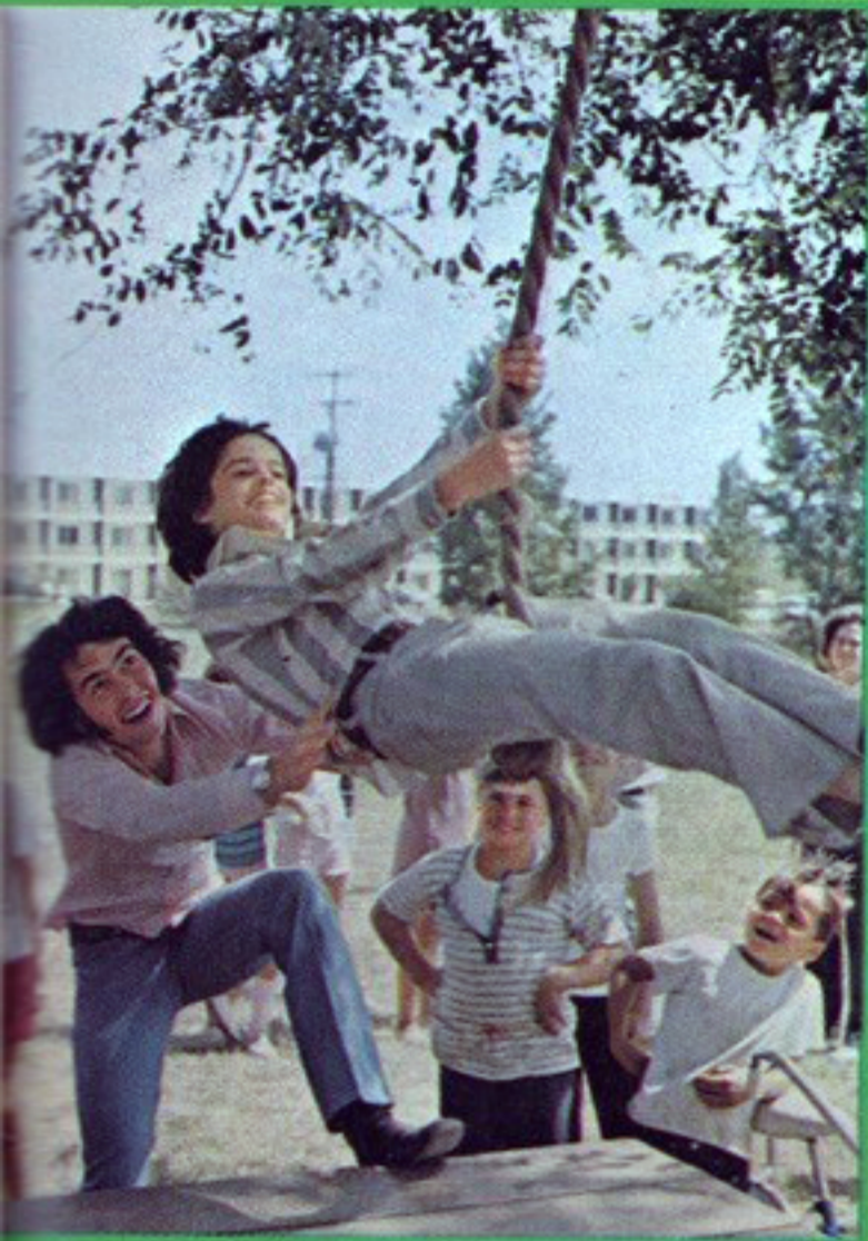
UP, UP AND AWAY and Donny Osmond sails into the blue sky! One of the reasons the Osmonds are such great guys is because they really know how to have fun! They love to spend a sunny afternoon in the park, so be on the lookout! You might find them just about anywhere!