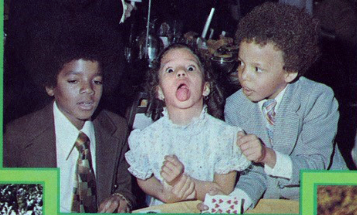
MICHAEL JACKSON'S FANS COME in all ages and all sizes! Michael loves talking to all of them and whenever he gets the chance, whether it's at a concert, on the street or at a fancy restaurant, he comes over to say "hello!" The Jackson Five may be adding a new member to the group any day now. The youngest Jackson boy, 9 year old Randy is gathering quite a following of his own!