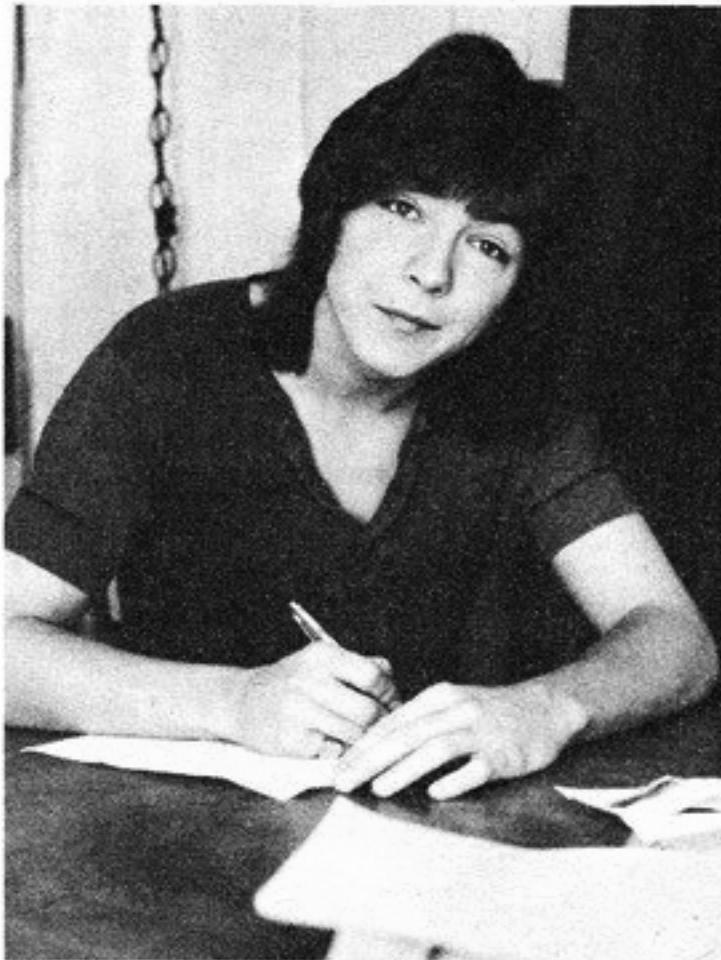
WIN A HANDWRITTEN PERSONAL NOTE FROM HIM!