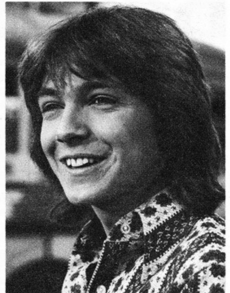
WIN THIS FAB POSTER—AND THAT'S NOT ALL!!!