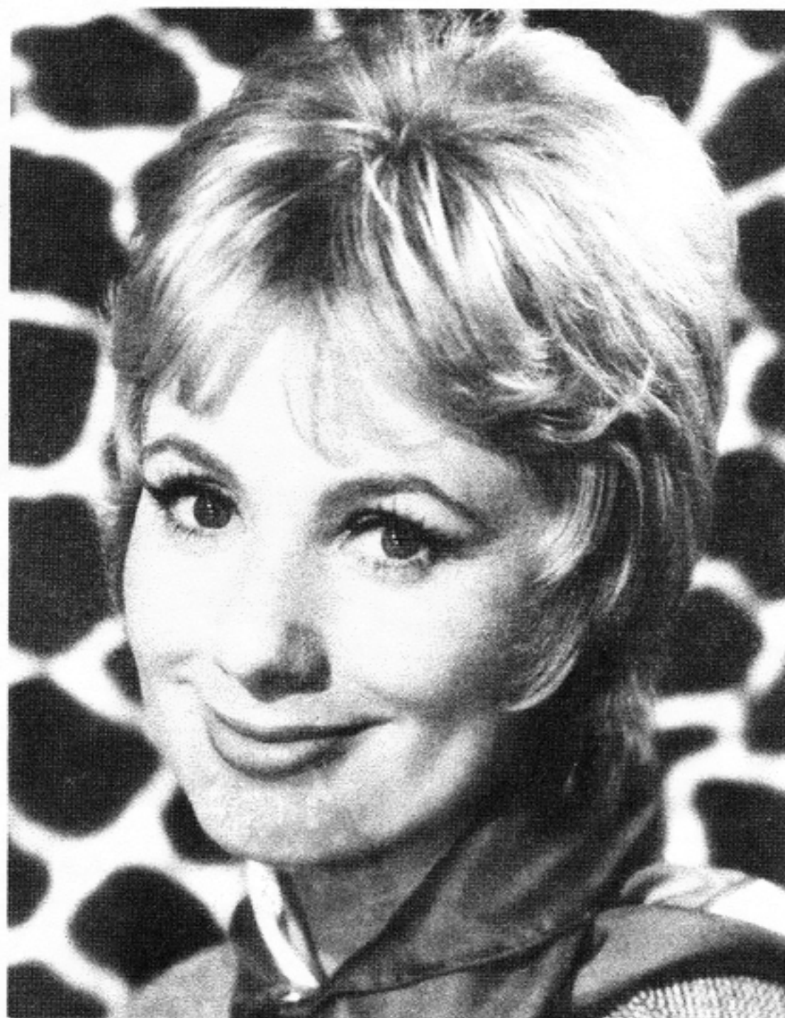
SHIRLEY JONES (THE PARTRIDGE FAMILY): Birthday—March 31; hat—20; blouse—36 (or Small); sweater—38 (or Medium); shoe—7; stockings—9; ring—6; favorite colors—every color of the rainbow; favorite gifts—postcards from your hometown and colorful drawings you do yourself; address—Screen Gems, 1334 N. Beechwood Drive, Hollywood, California 90028.