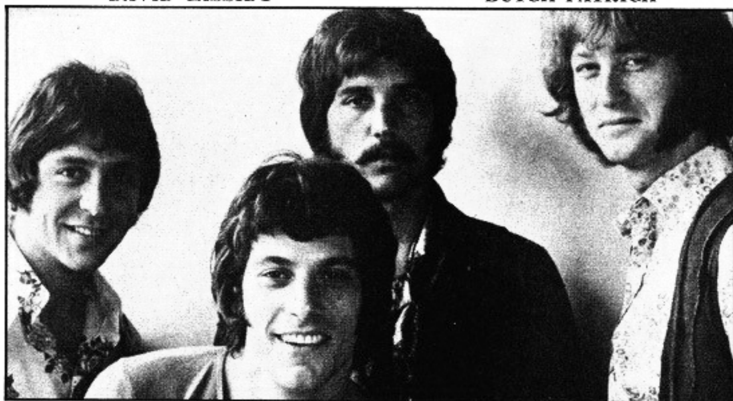
THE GRASS ROOTS