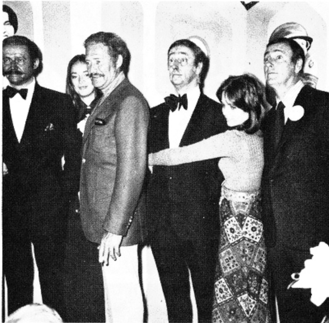
Dan Rowan and Dick Martin were immortalized in a wax museum and their wives pretended to like the wax dummies better!