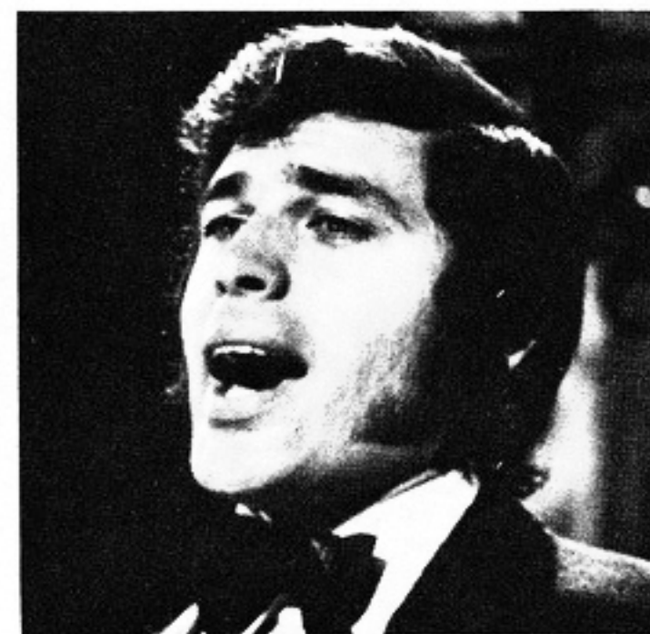
Engelbert Humperdinck's the latest of the singers to hanker after an acting chance!