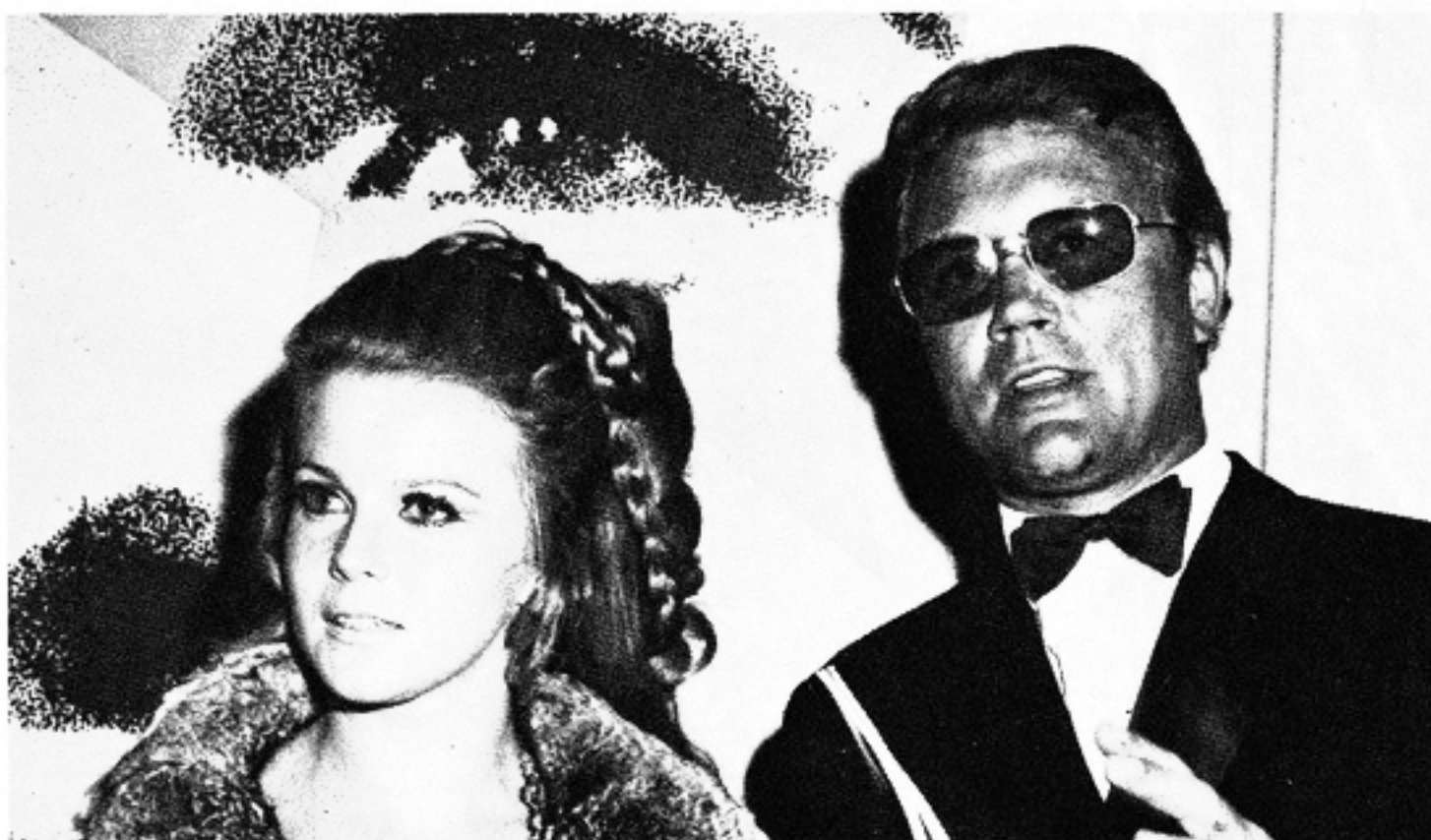
Ann-Margret, here with hubby Roger Smith, has her eye on more meaty dramatic roles!

DAVID CASSIDY will soon be the richest young man in the world if he keeps grossing the fabulous earnings on his concerts in 1972 the way he did last year. In only an 8-month period last year from mid-May to early December—and working only on the weekends—handsome David smiled and sang his way to $1,061,000 on the concert circuit. Not bad for a weekend gig!