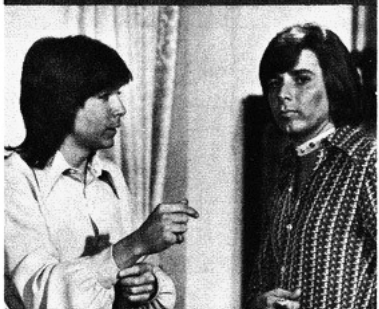
David Cassidy, whose show is a huge success, consoles pal Bobby Sherman, whose show was cancelled. Don't worry, Bobby, we love you.