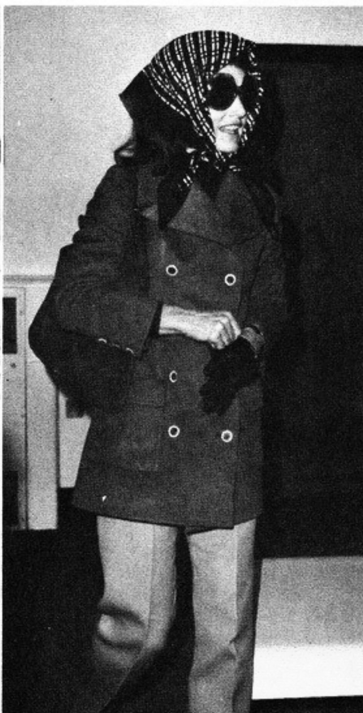
Reportedly, Jackie O and Daddy O had big battle at London Airport. "Nonsense," they claim. Jackie still in legal battle with photog.