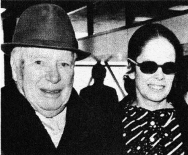
Charlie Chaplin, with wife Oona, will come to California for Oscar awards. This will be his first trip here in many, many years. Can't wait!