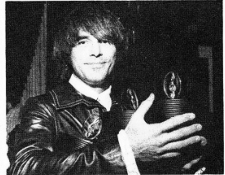
Above: Singer Joe South holds three of the five awards he recently won. Below: new star Barry Robins is an intellectual pianist.

RICHARD HATCH of "All My Children" has become interested in some other children recently, primarily the cast of off-Broadway's newest hit, "Love Me, Love My Children," at the Mercer-O'Casey Theatre. After two attempts at getting Richard on "Room 222," the producers finally came up