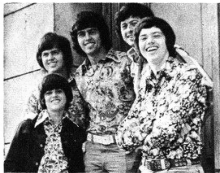
Don't miss Osmond Stickers pg. 18, 82!