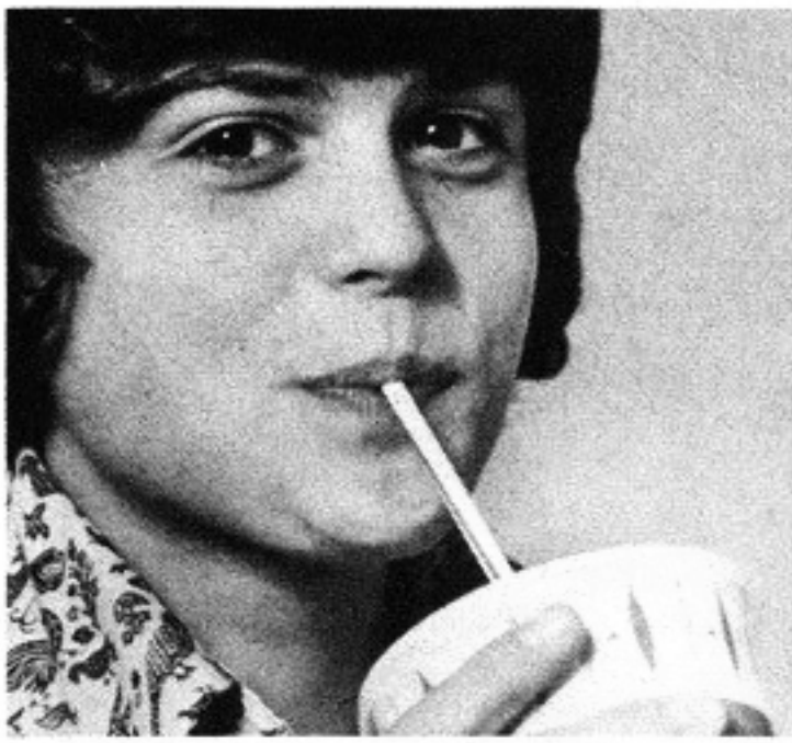
Donny's favorite shake? Chocolate!

Can you believe it? This month marks my sixth anniversary with Tiger Beat! I can honestly say that in those six years I can't remember a dull moment. But the time has come to write probably the most difficult Meow column in the past six years. Because it's my last.