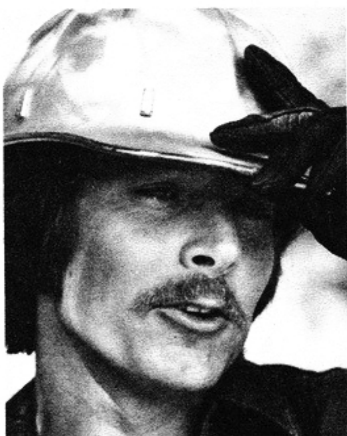
Bobby on Mod Squad