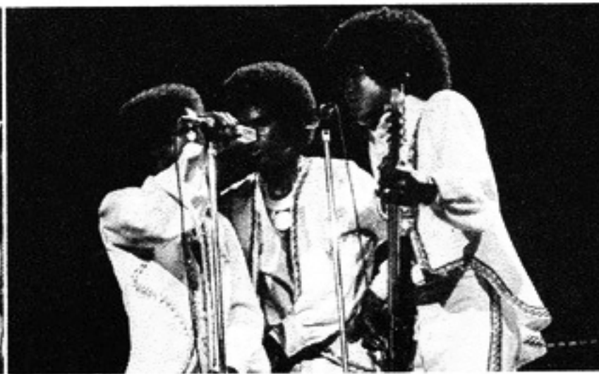
Marlon, Jackie & Jermaine in concert