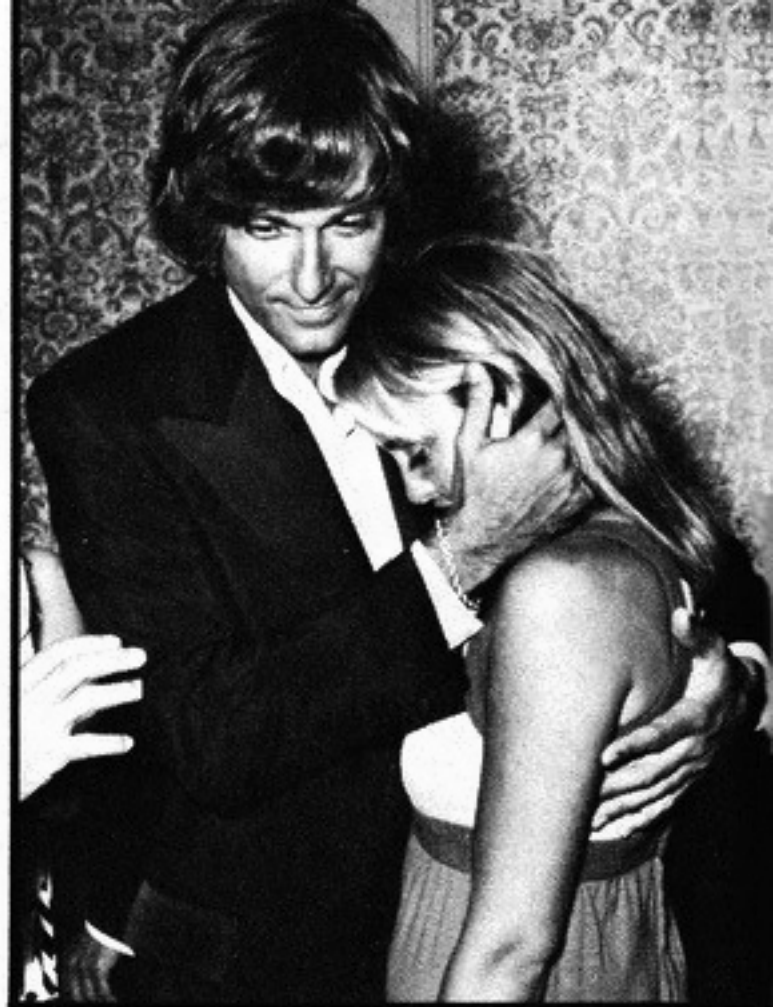
Susan George hasn't made any movies since Straw Dogs —and although she denies it, Jack Jones is the reason.