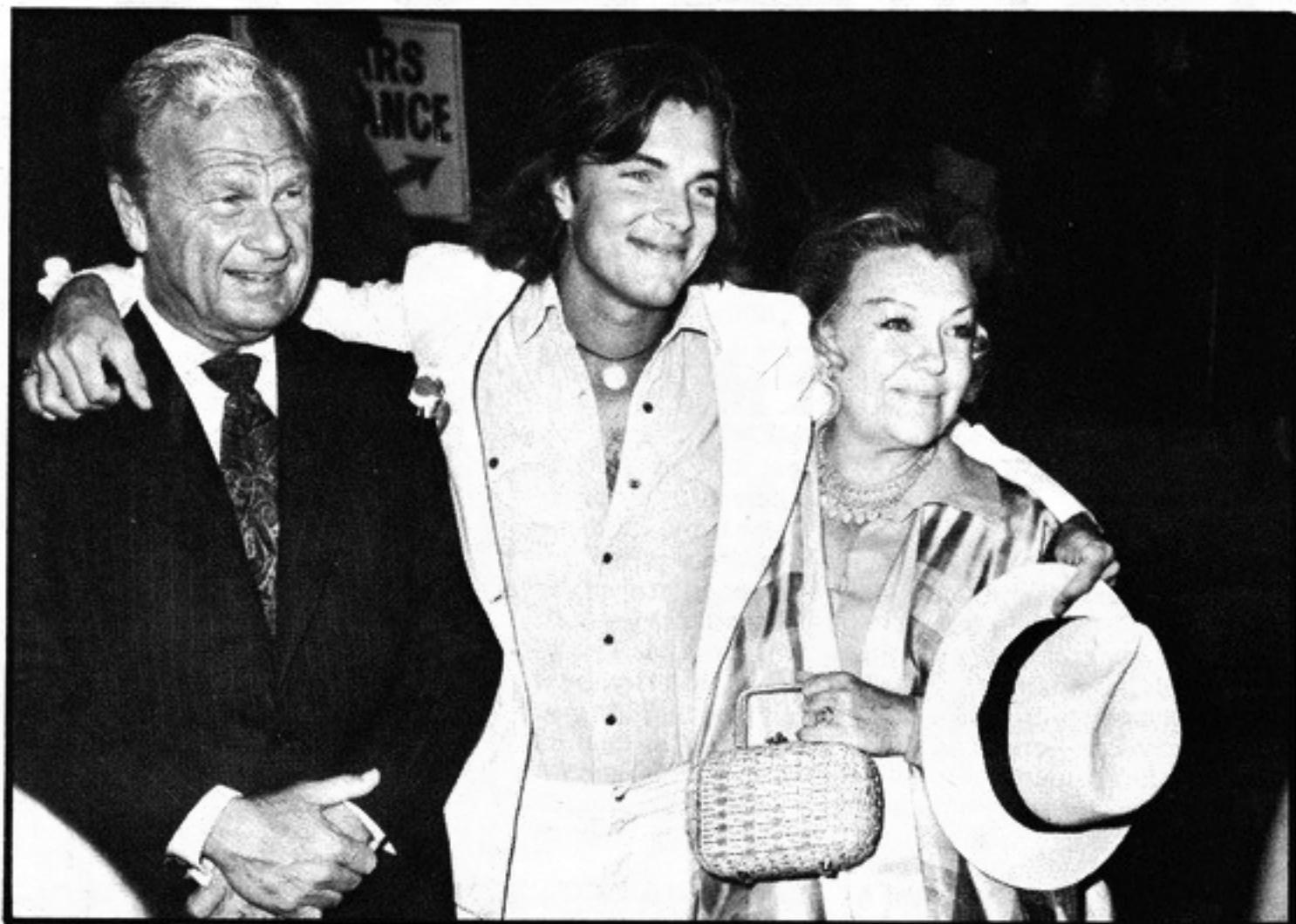
Eddie and Margo Albert were the honored guests at the Hollywood premiere of Butterflies Are Free , in which their handsome son Ed stars.