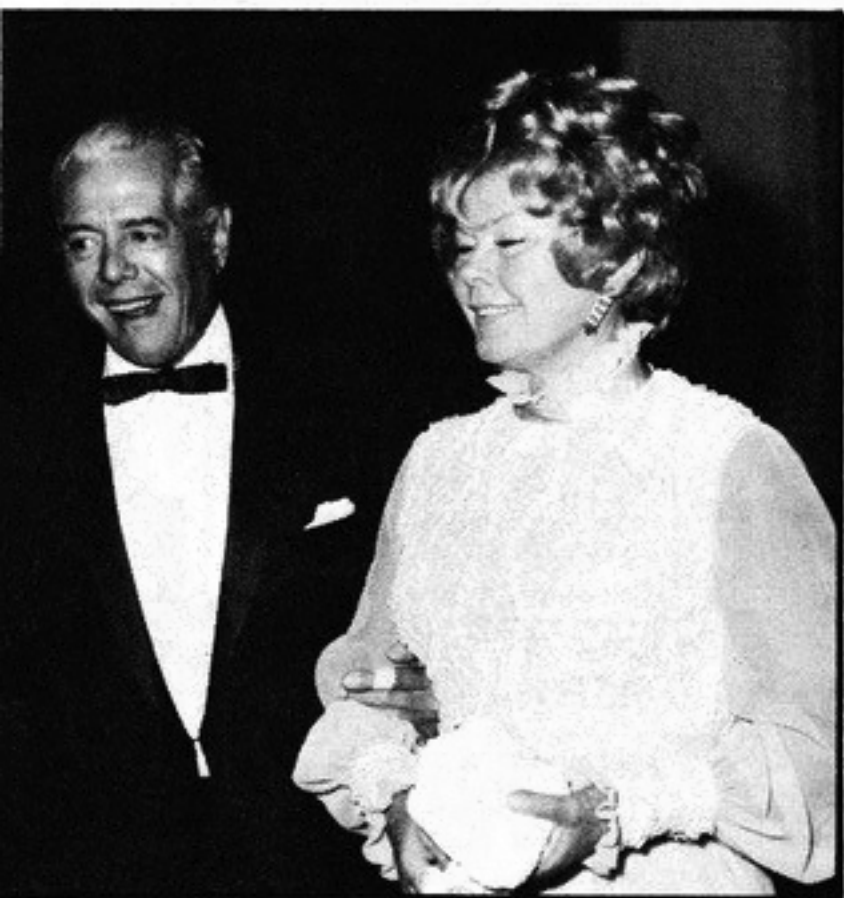
Desi Arnaz Sr., with wife Edith, refuses to comment on son Desi's on-again, off-again romance with Liza.