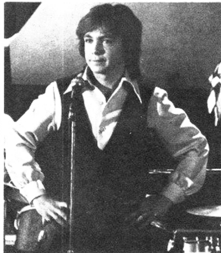
Wherever he goes, the handsome young singer/actor is swamped by adoring fans who are eager to get a piece of him, his clothing or anything else they can get their hands on. For David, this means avoiding the fans at all costs, or else risk his personal safety—maybe even his life.