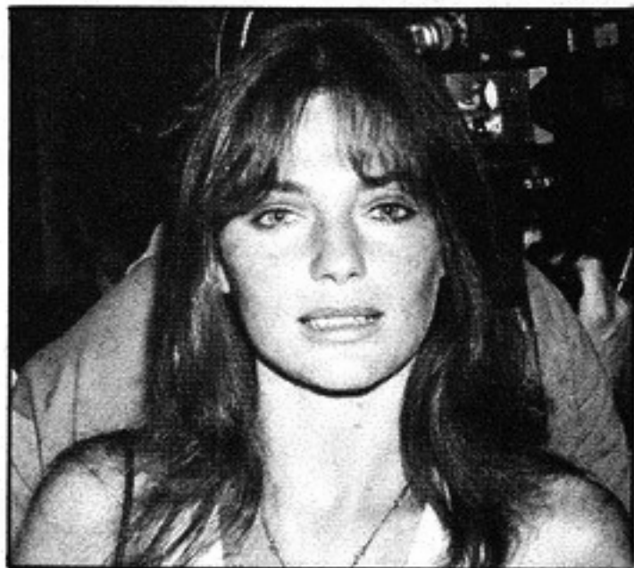
JACKIE BISSET is back with her Michael Sarrazin—here, on set of his new movie, "Ground Star Conspiracy"!