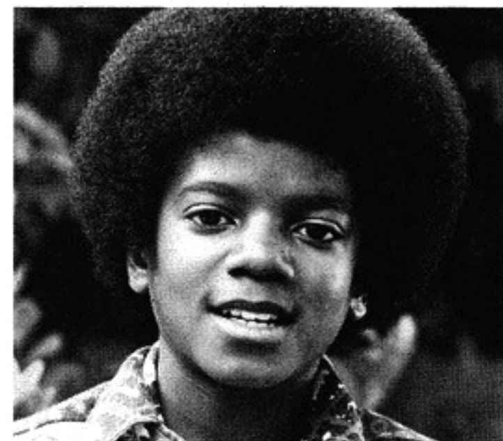
MICHAEL AND HIS brothers are always busy recording—separately, too!

And, here's a hot tip from MRS. OSMOND . At their home in Utah,