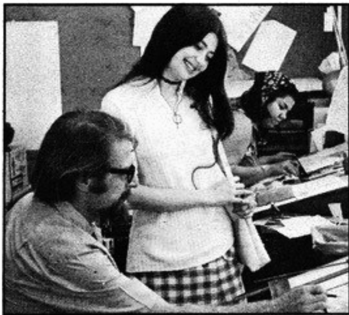
"THE ART department is a busy place! I never knew it was so complicated. It was really fascinating!!"