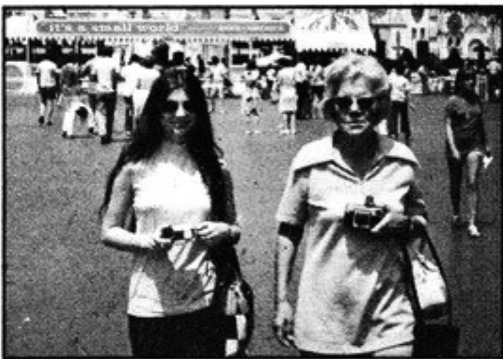
"WE HAD A ball at Disneyland! As you can guess, we got a lot of pictures! I could go back tomorrow—I loved it!!"