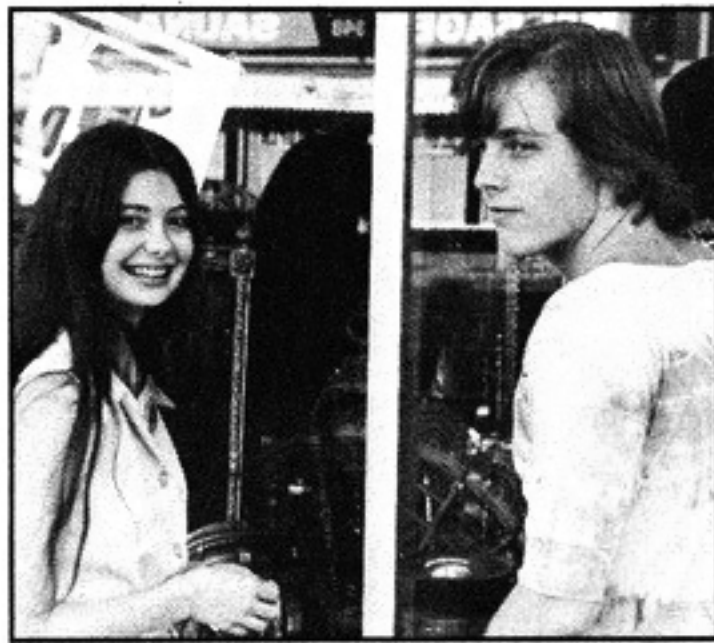
"MARK HAMILL and I both love window shopping—and what a nice guy Mark is to go strolling around with!"