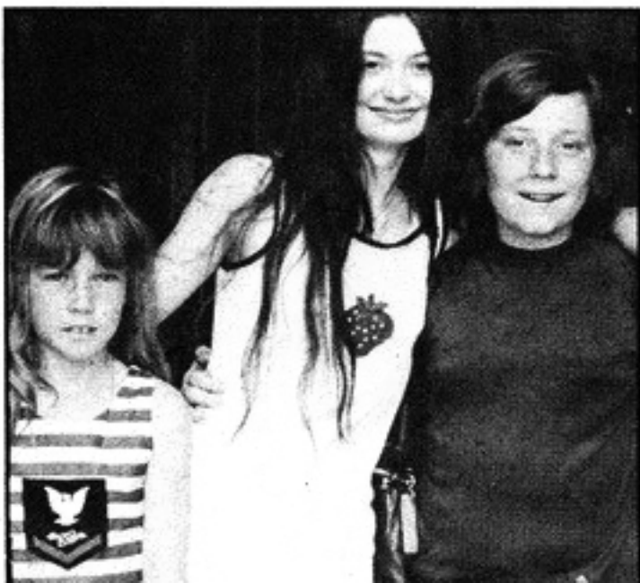
"MEETING DAVID is what I'll always remember most when I think about my great trip! I hope YOU win sometime!"