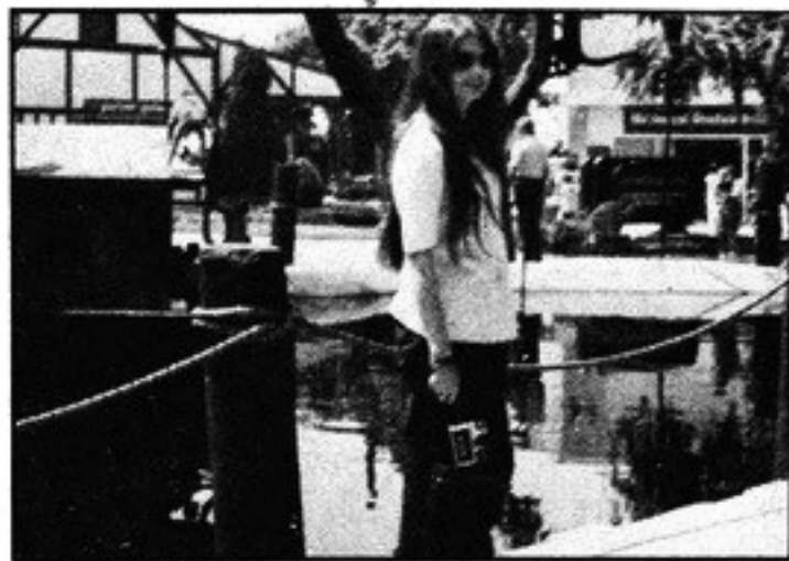
"THIS IS at Universal Studios! We had just finished the great tour they have! I learned a lot about TV and movies!"