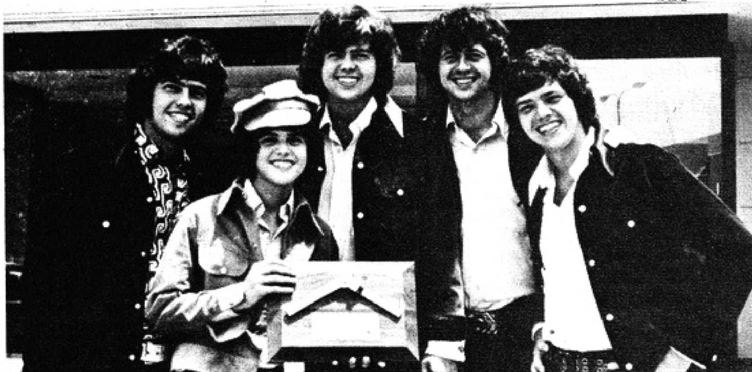
THE OSMONDS have been honored by the United Cerebral Palsy Association in Los Angeles for "outstanding cooperation and unselfish, devoted service"!!