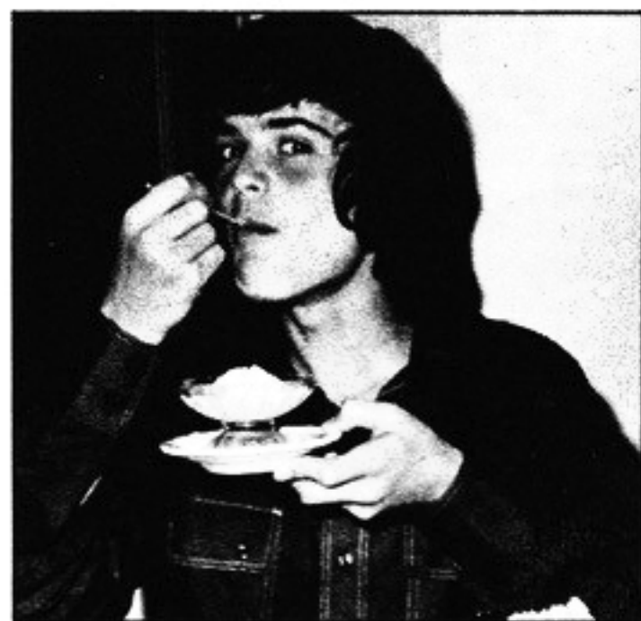
DON'T FORGET, CALIFORNIA! The Osmonds will be in Anaheim on Sept. 8.

I didn't think David would want another dog since his puppy Kula died but now he's talking about getting not one, but two puppies! I guess you just can't keep David away from animals—he really loves them.