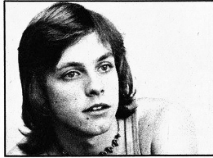
LOOK FOR GROOVY Mark Hamill to be a regular on "General Hospital!"