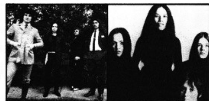
GUESS WHO FANNY