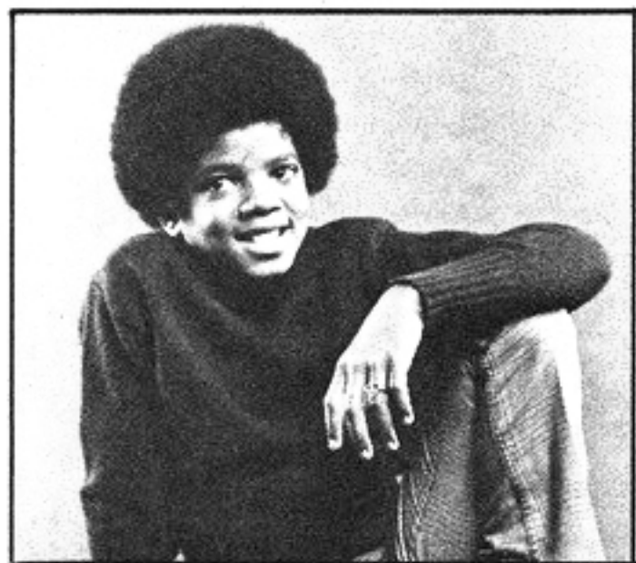
A BRIGHT SWEATER & bright pants are good tip-offs to the kind of guy Michael Jackson is—bright & perky!