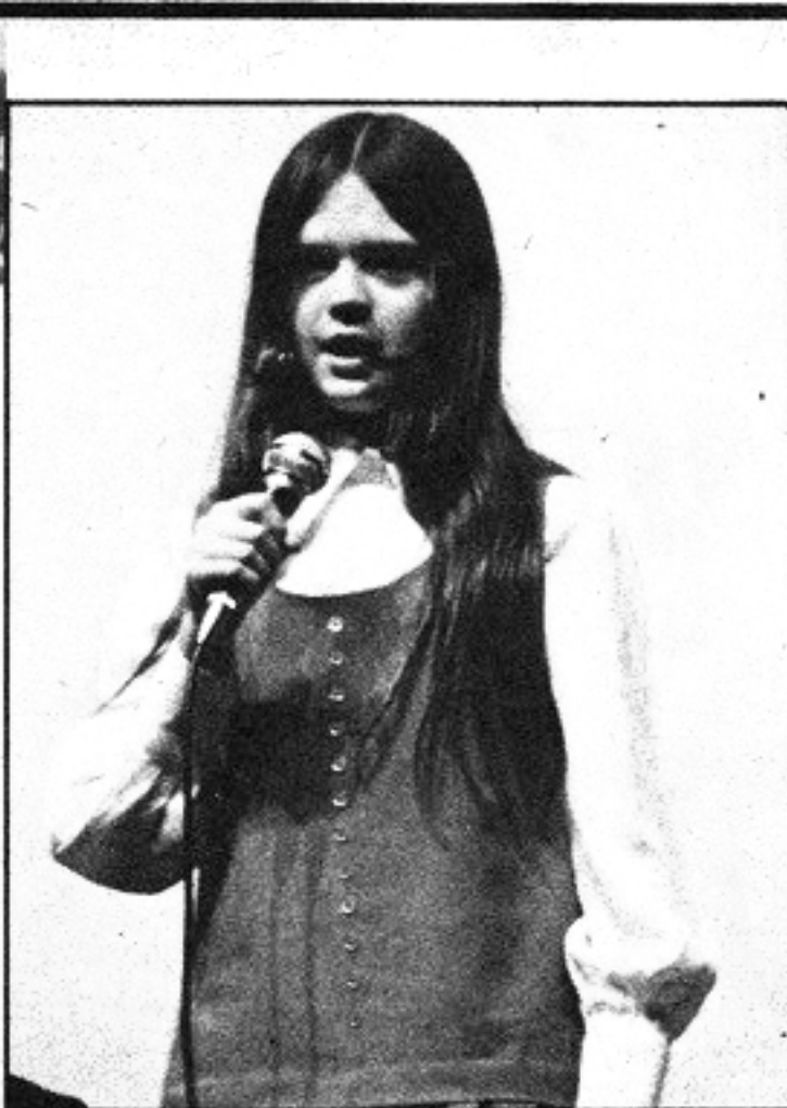
FEMININE & SIMPLE are the rules that Marie Osmond follows when she buys clothes—she's always feminine.