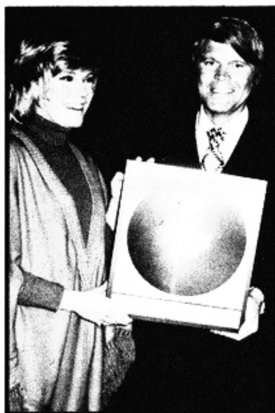
ANNE MURRAY & GLEN CAMPBELL

with their recent sell-out concert. The previous record holder was the presentation of "Jesus Christ Superstar" . . . Contrary to the popular belief that all girls are interested in "Women's Lib," the female rock group, Fanny , hired three male brass players to do back-up at their concerts, proving that they're "equal opportunity employers!" . . . Michael Gray will play the part of a rock musician in an upcoming "Marcus Welby." The plot sounds interesting, so keep your eyes open for it! . . . Chad Everett and his beautiful wife, actress Shelby Grant , will star together in "Seven Inch Wilderness," a movie about man's struggle for