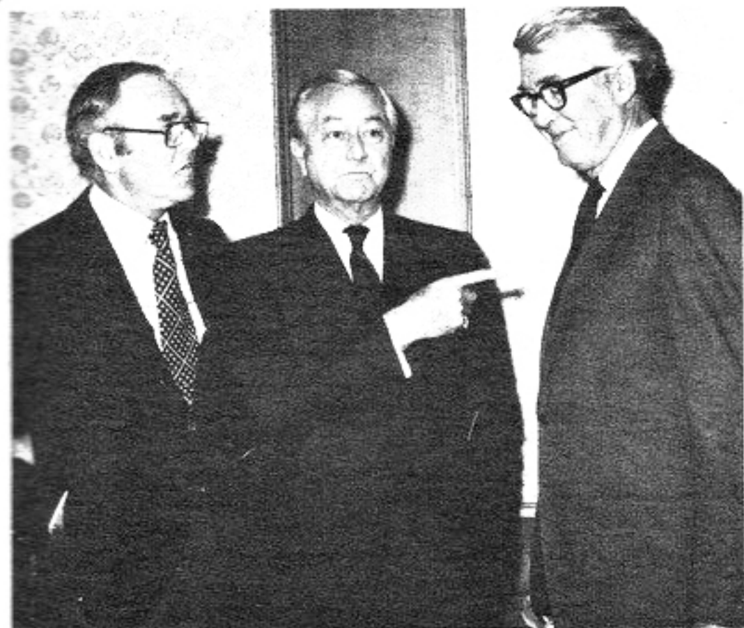
When three acting veterans get together, there's bound to be some friendly conflict, and Jimmy Stewart is the object here of Henry Fonda and Robert Young's attentions.

The Guessing Game: (Continued on page 80)