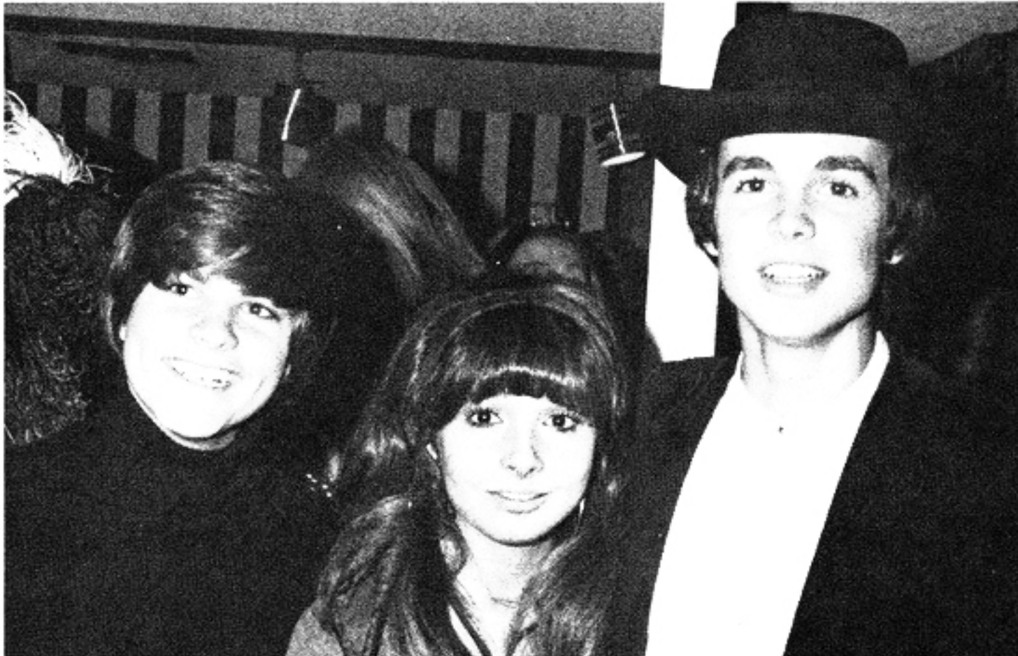
DAVID, JUDY AND JOHN

LAST MINUTE THINGIES: David Cassidy's considering an offer to do a concert tour in Australia... Ex-Monkee Micky Dolenz guest starred as a rock group leader on "My Three Sons" ... This show, by the way, has finally been cancelled after who remembers