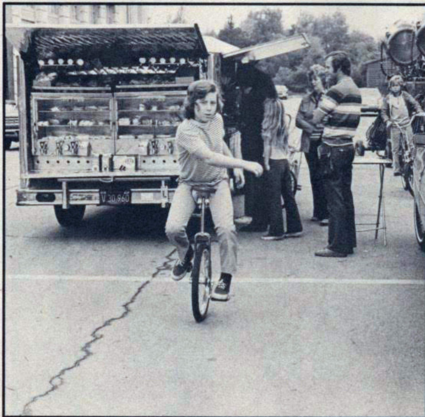
THE GOOD OLD faithful food truck arrives at 1:00 and honks its horn to announce its arrival like it has for the past two years. It's a good time for Partridge watching because they all come out of their trailers for snacks.