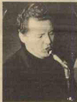
Jerry Lee Lewis