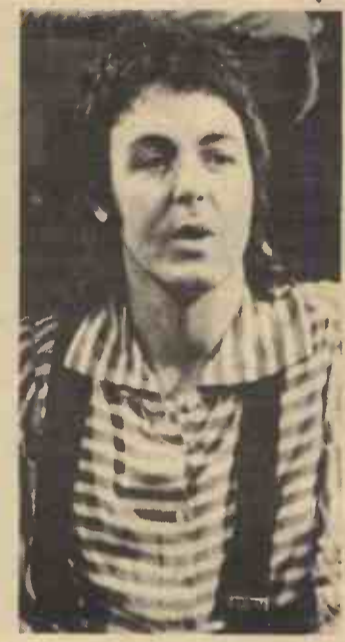
PAUL: not interested