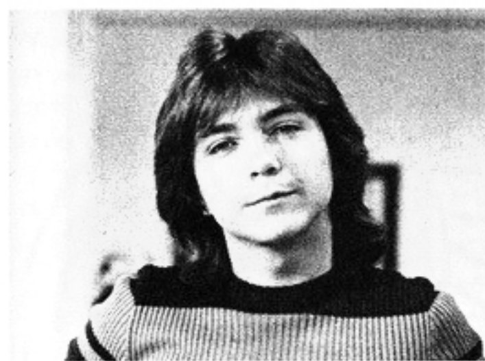
ANSWERS TO TV QUIZ ON PAGES 58 & 59