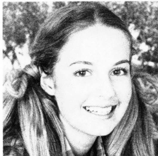
Did you catch Kym on "The Brady Bunch"?