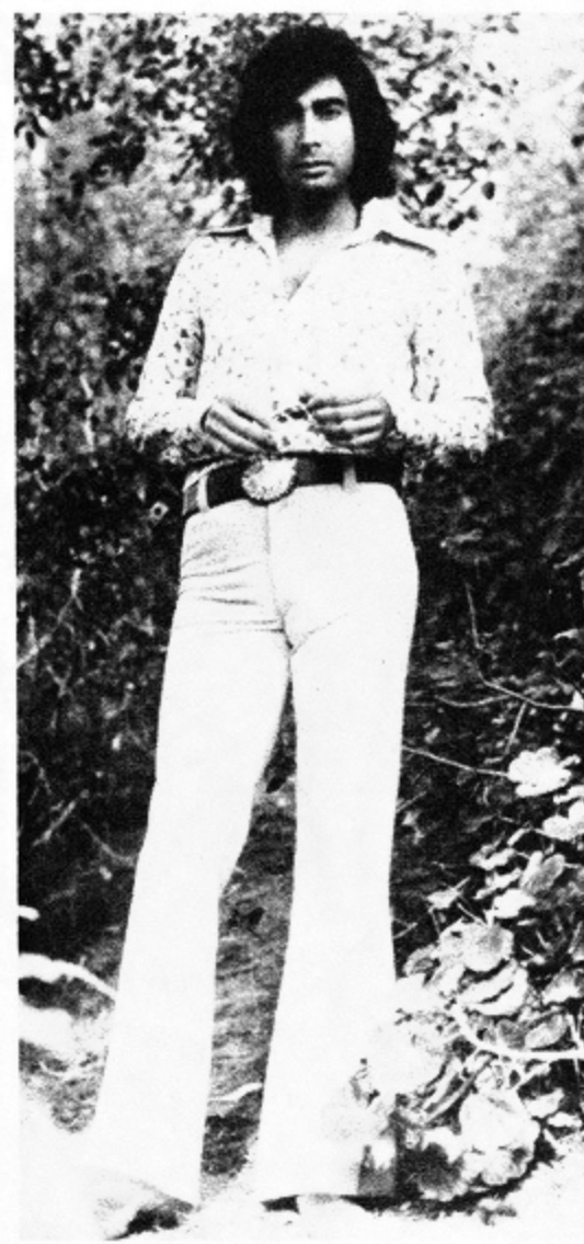
Will Andy Kim cut a new record album soon?

BITS AND PIECES: ANDY KIM is really keeping busy with writing scores for TV shows, guest starring on "Barnaby Jones" and coming up with a new album . . . He's all well now, but WAYNE OSMOND spent two days in the hospital having his troublesome wisdom teeth yanked . . . RASPBERRIES are touring, as usual, but paused to do both "Bandstand" and "Midnight Special" . . . MARK SPITZ turned down an offer to present an Oscar at the Academy Awards because he felt the job should go to someone more involved in movies . . . RICHARD CARPENTER broke both wrists and one leg in a cycle accident but is right back in the recording studio with sister Karen, casts and all . . . BOBBY SHERMAN 's two day