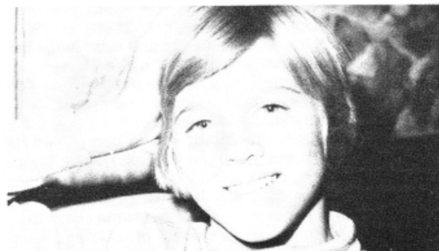
Vincent Van Patten