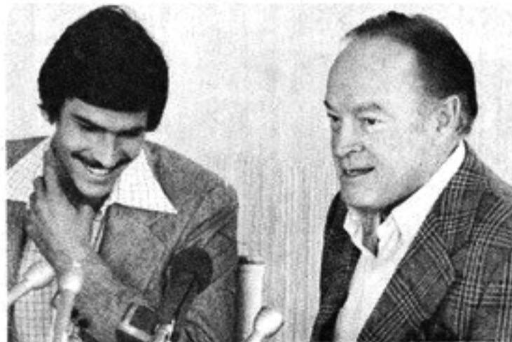
Bob Hope hosts a press conference for Mark Spitz at his home.