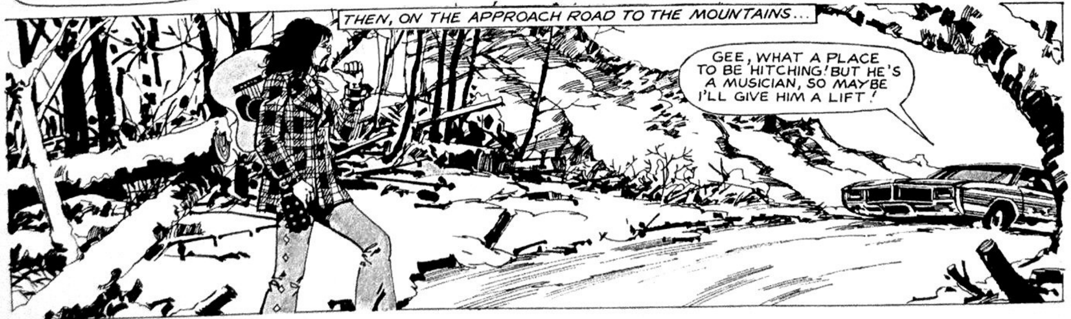
THEN, ON THE APPROACH ROAD TO THE MOUNTAINS...

GEE, WHAT A PLACE TO BE HITCHING! BUT HE'S A MUSICIAN, SO MAYBE I'LL GIVE HIM A LIFT!