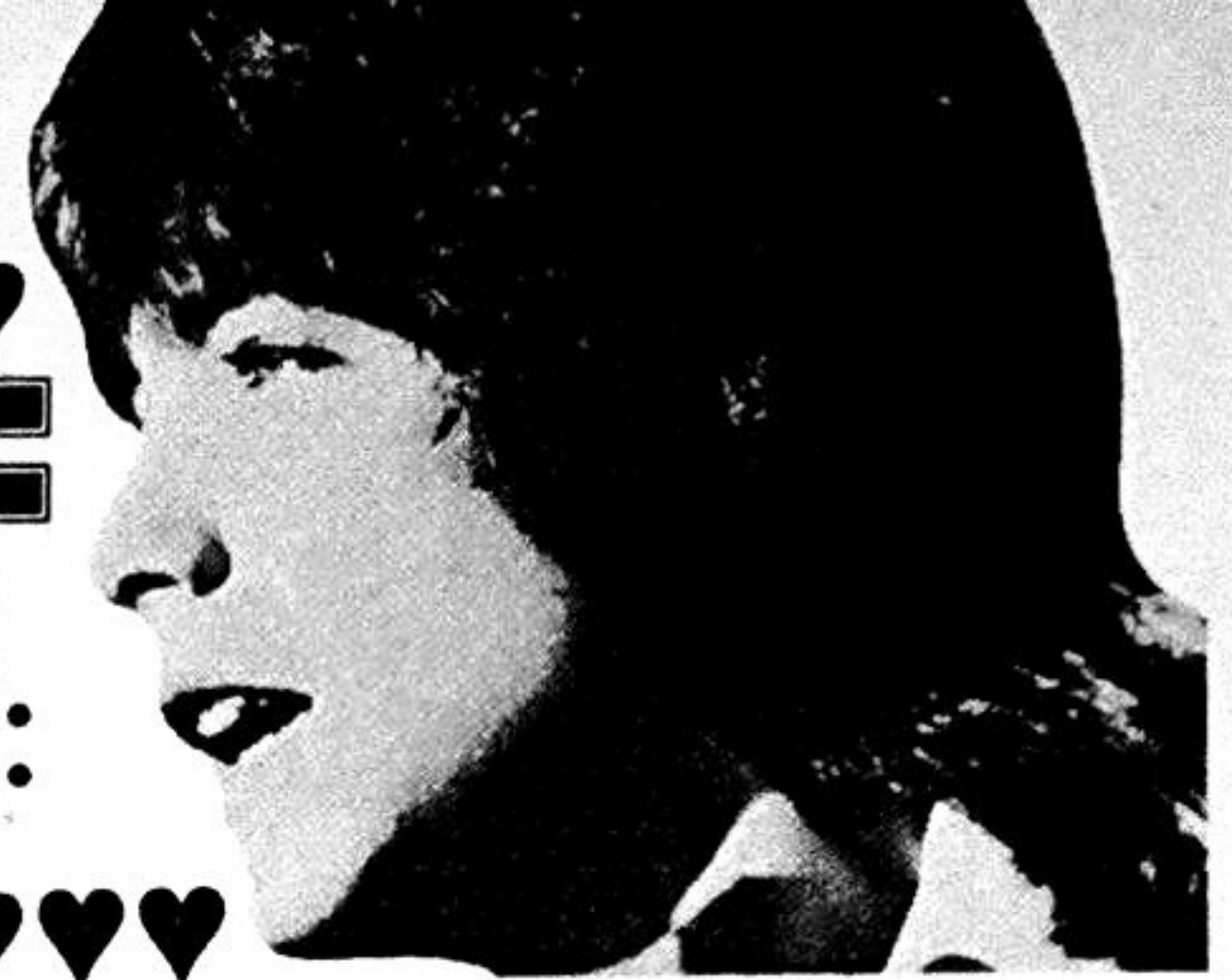
A MIDDLE WESTERN RECORDING STUDIO-WHERE DAVID CASSIDY IS MAKING SOME SPECIAL BROADCAST RECORDS...