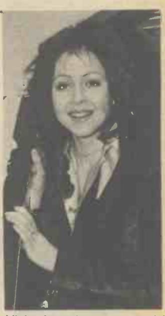
Vicky Leandros — top girl singer in the world.

The results give a fairly accurate picture of what artists and their records sold over the shop counter