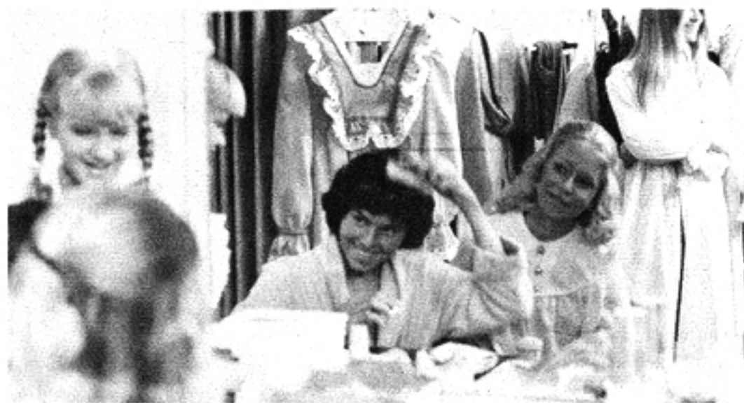
QUICK brush & Bradys are ready!

Most fans only get to see their faves from the audience side of the stage. But now you are privileged to be invited not only backstage but on the set too! Follow your fave's footsteps as he or she prepares for a concert, or that big scene. Share the breathless moments of joy and tension. Quiet on the set!