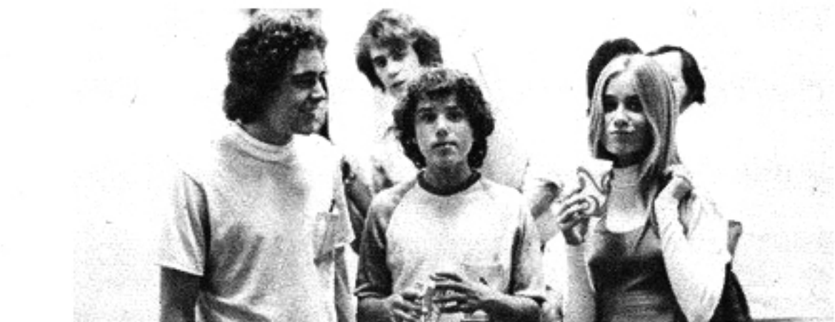
3 BRADYS share a relaxing drink & conversation before 58 dressing for a concert. They need moments like this.