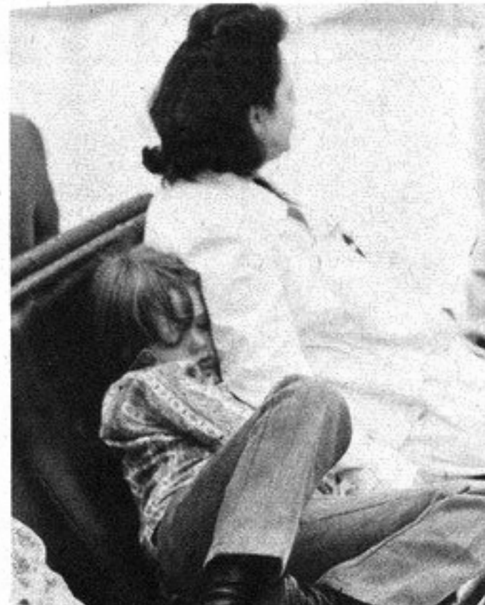
TRAVEL CAN be tiring, especially for a little guy like Jimmy!