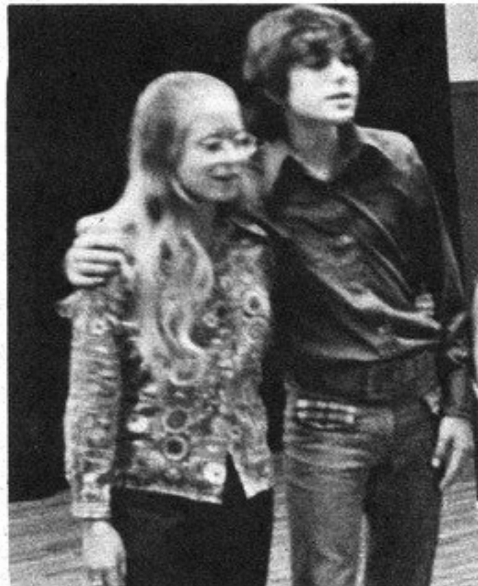
THE BRADYS practice in front of a mirror—like ballet dancers!