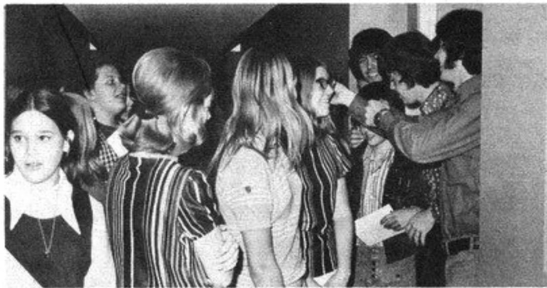
NO MATTER HOW tight the security, fans always find the way to the Osmonds! And the boys love it that way!