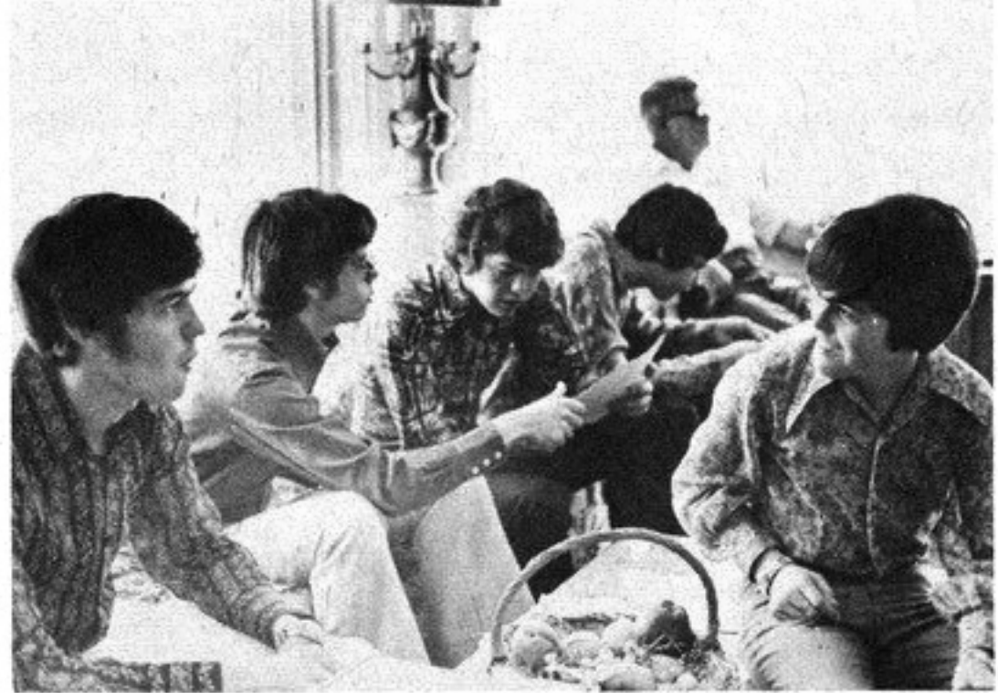
A BASKET OF fruit from the hotel management—and always lots of fan mail to be read between shows!