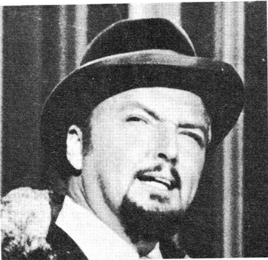
Another star of show biz is David's father— Jack Cassidy.

She encouraged him to do his best and was both astonished and pleased when David won a co-starring role in the Broadway musical, "The Fig Leaves Are