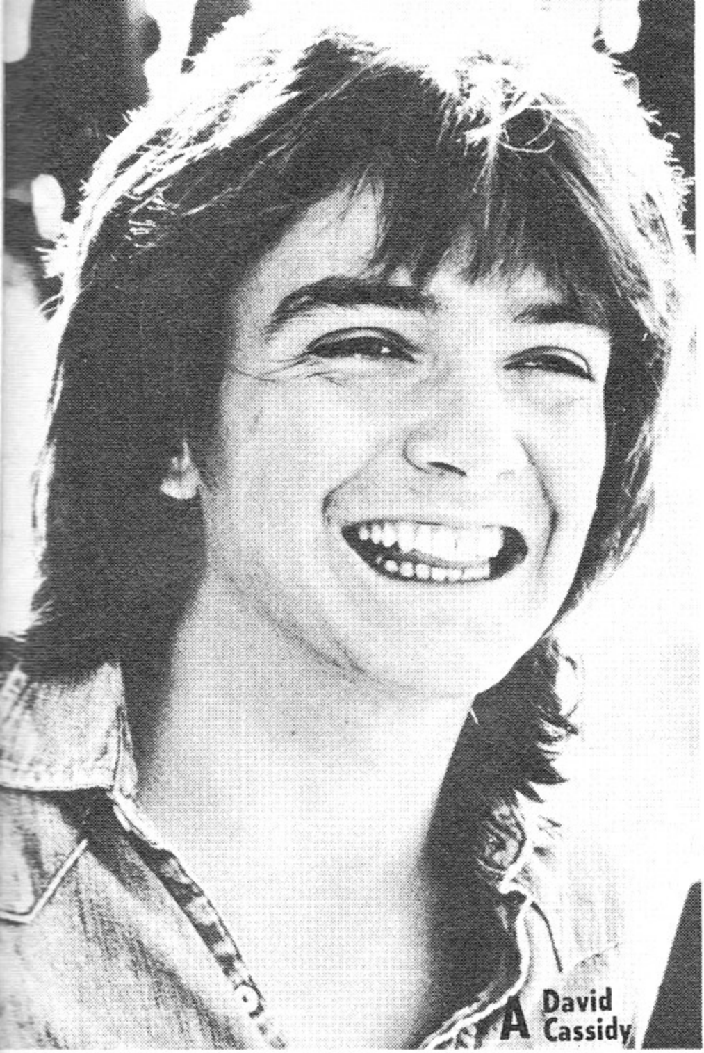
A David Cassidy