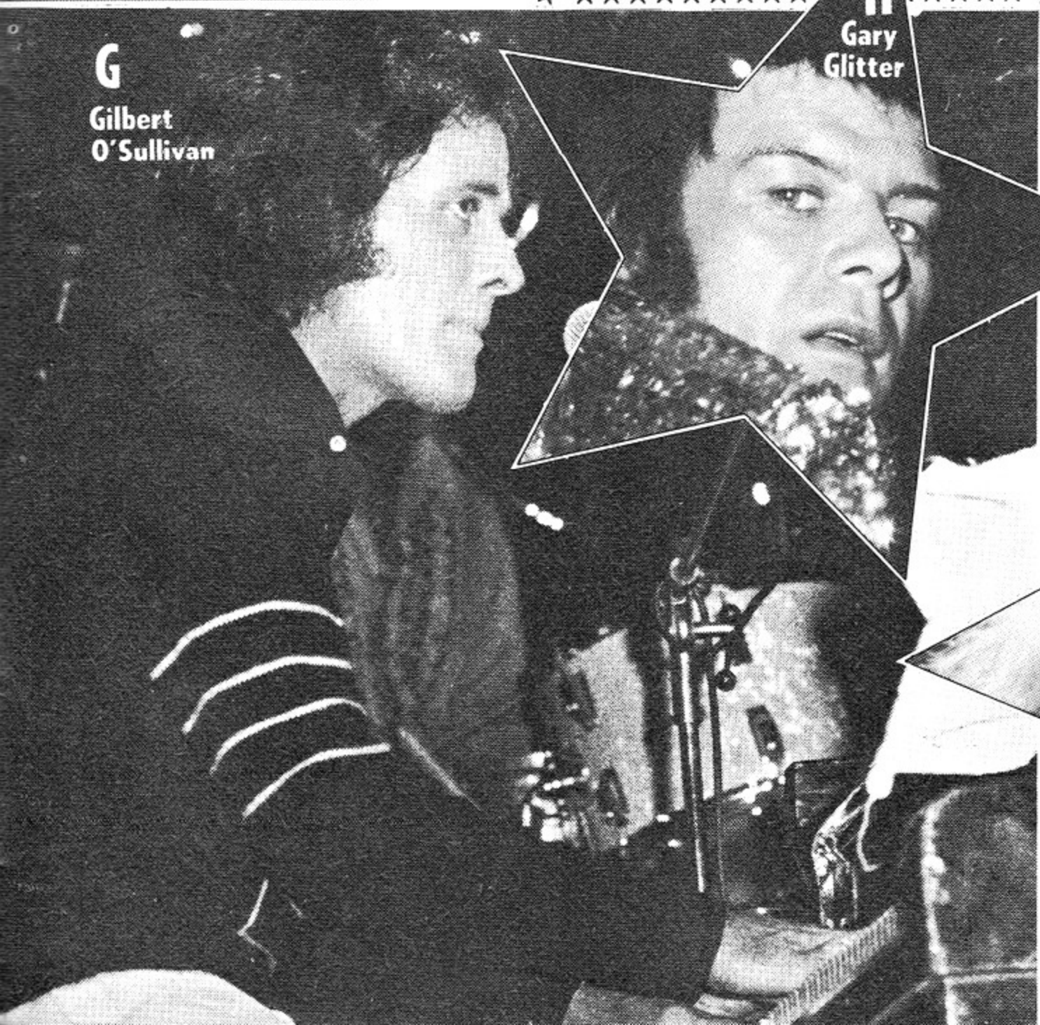
G Gilbert O'Sullivan