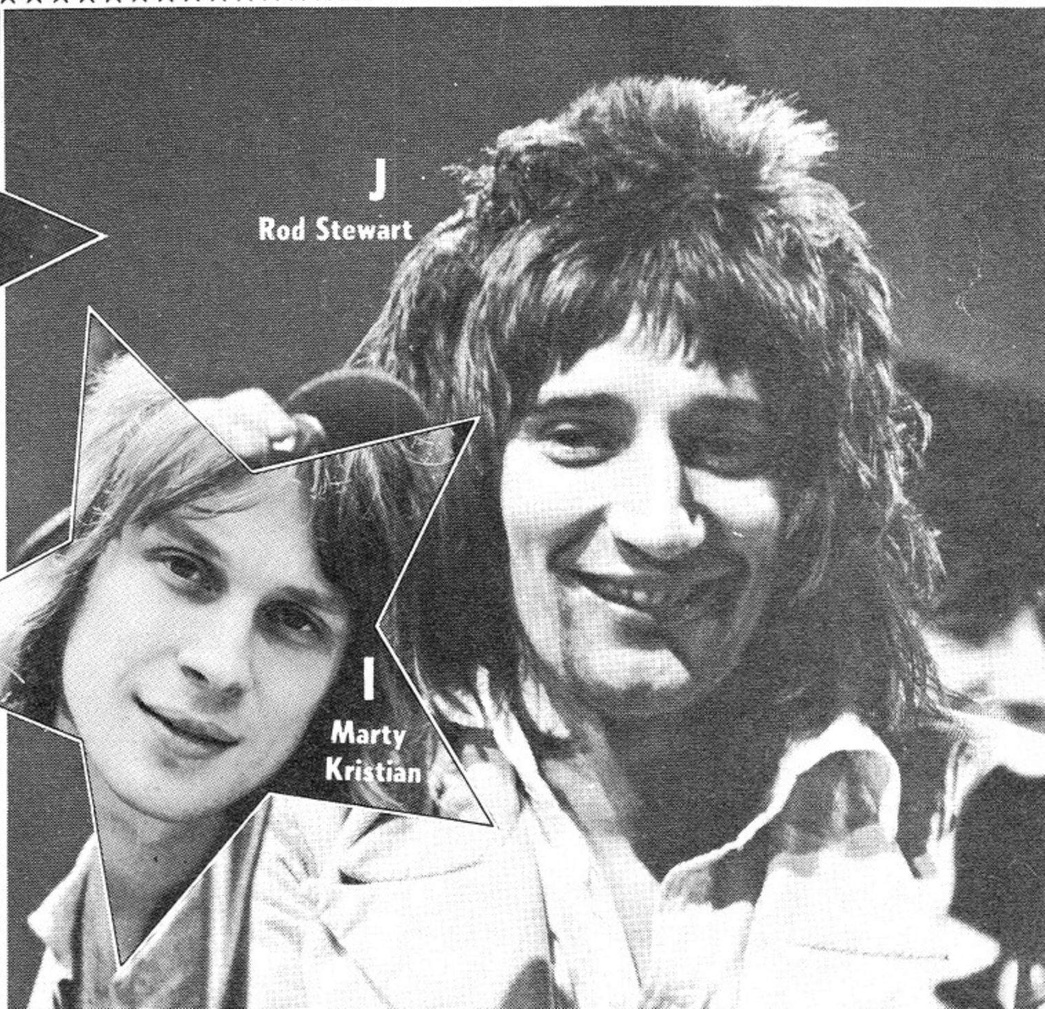
J Rod Stewart