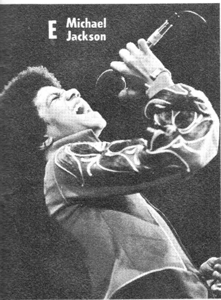
E Michael Jackson