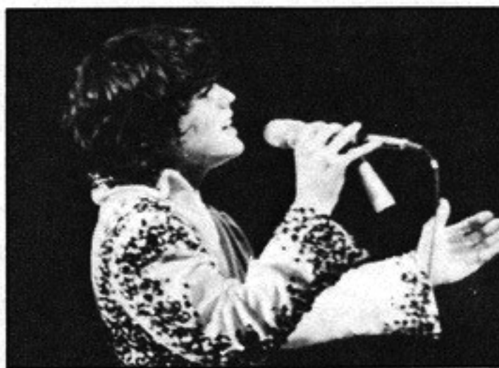
DONNY reaches out to the audience while singing "Are You Up There" a song on new Os album "The Plan."