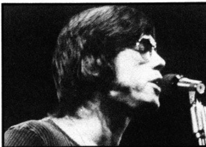
SAILCAT had a really big hit with "Motorcycle Mama"—guess who wrote it?

entertainers start feeling better and are up and around real soon! . . . Paul McCartney will score the new James Bond flick, "Live and Let Die" . . . Sonny & Cher were named top variety act of the year by the annual Las Vegas Entertainment Awards Competition . . . Word has it that Russian male ballerina Rudolf Nureyev is dating "Mama" Cass Elliot . (Guess he finally found someone who could keep him on his toes!) . . . Engelbert Humperdinck nearly caused a riot at the Riviera Hotel in Vegas—he took over as blackjack dealer, and everyone wanted to play! . . . Congratulations to Chi Coltrane (pronounced "shy") for penning her super hit "Thunder and Lightning"