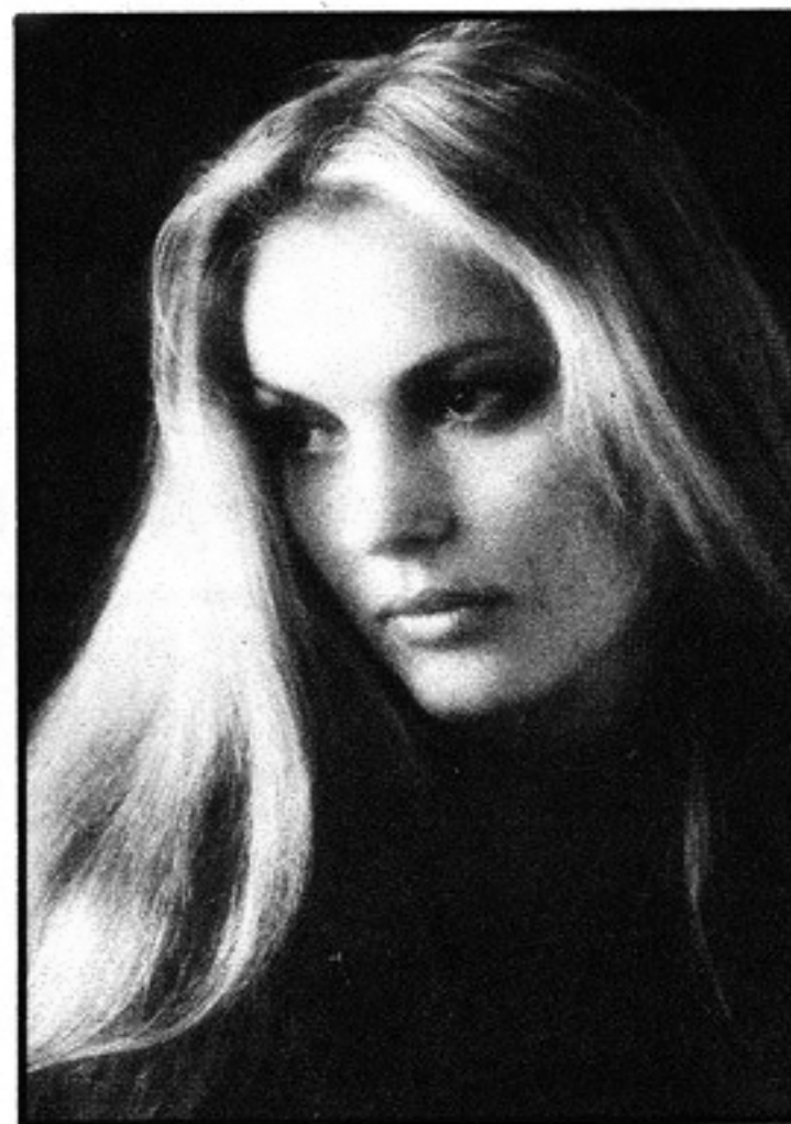
CHI COLTRANE is a great songwriter!

sils removed, they were put on public display! . . . Shirley Jones suggests after applying make-up foundation, press a piece of cotton to your face that has been dipped in ice water to help set the make-up . . . February 22nd birthdays are being shared by Susan Neher , Oliver , and David & Andy Williams . . . Sailcat's "Motorcycle Mama" was written about group member John Wyker's old high school sweetheart . . . Roger Davis of "Alias Smith and Jones" had to have 19 stitches in his forehead; the result of a light toppling and hitting him on the head . . . Meanwhile, James Brolin broke his ankle while riding a motorcycle for a scene in "Marcus Welby," and Bobbie Gentry broke her nose on a microphone while performing at the Desert Inn. Let's hope these talented